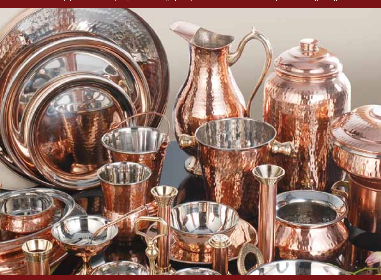
Pure Copper Range for the Connoisseur...

La Coppera brings you this gift of nature in all its pristine glory