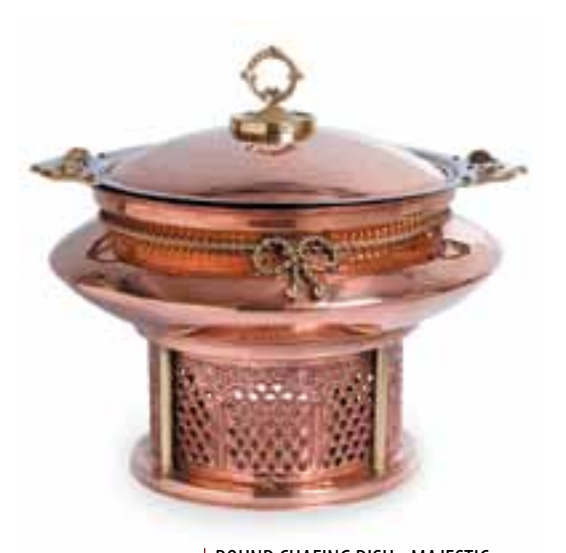
ROUND CHAFING DISH - MAJESTIC Copper, Stainless Steel, Brass Available in 3 Sizes