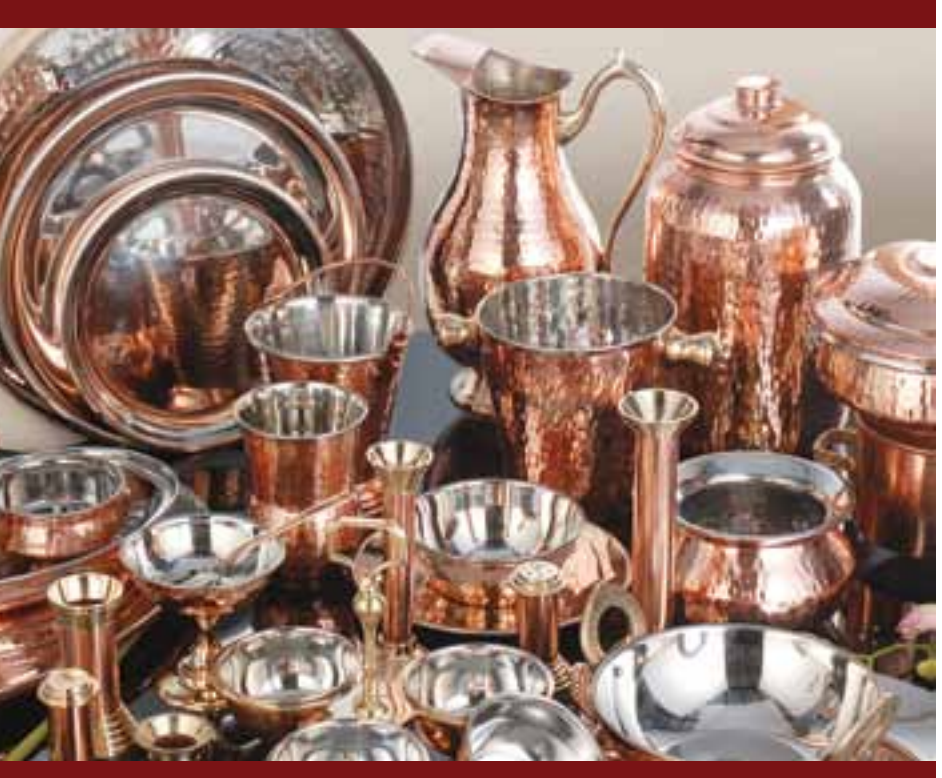
Pure Copper Range for the Connoisseur...