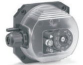
Krom Air Switch