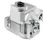
Honeywell Control Valve