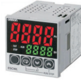
Omron Temperature Setting