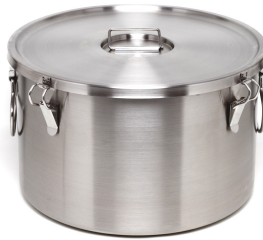
Stainless Steel Food Container (Deep-Height)