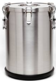
Stainless Steel Insulated Food Carrier