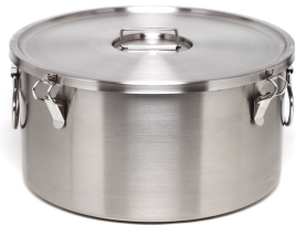
Stainless Steel Food Container (Medium-Height)