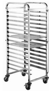
Stainless Steel Trolley for Baker Tray