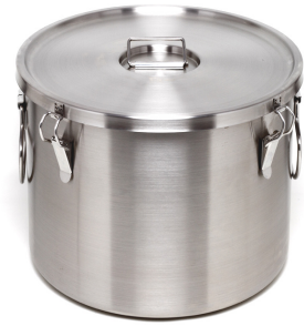
Stainless Steel Food Container (Stock Pot)