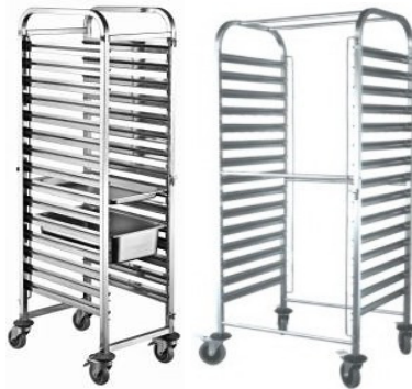
Stainless Steel Trolley for GN Pan